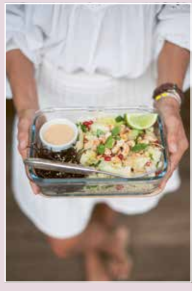
*Arame: this is a good seaweed for beginners due to its sweetish flavor. After soaking it in water for 10 minutes you can stew or fry it in a wok. Yummy with a few drops of tamari (soy sauce) and sesame seeds.