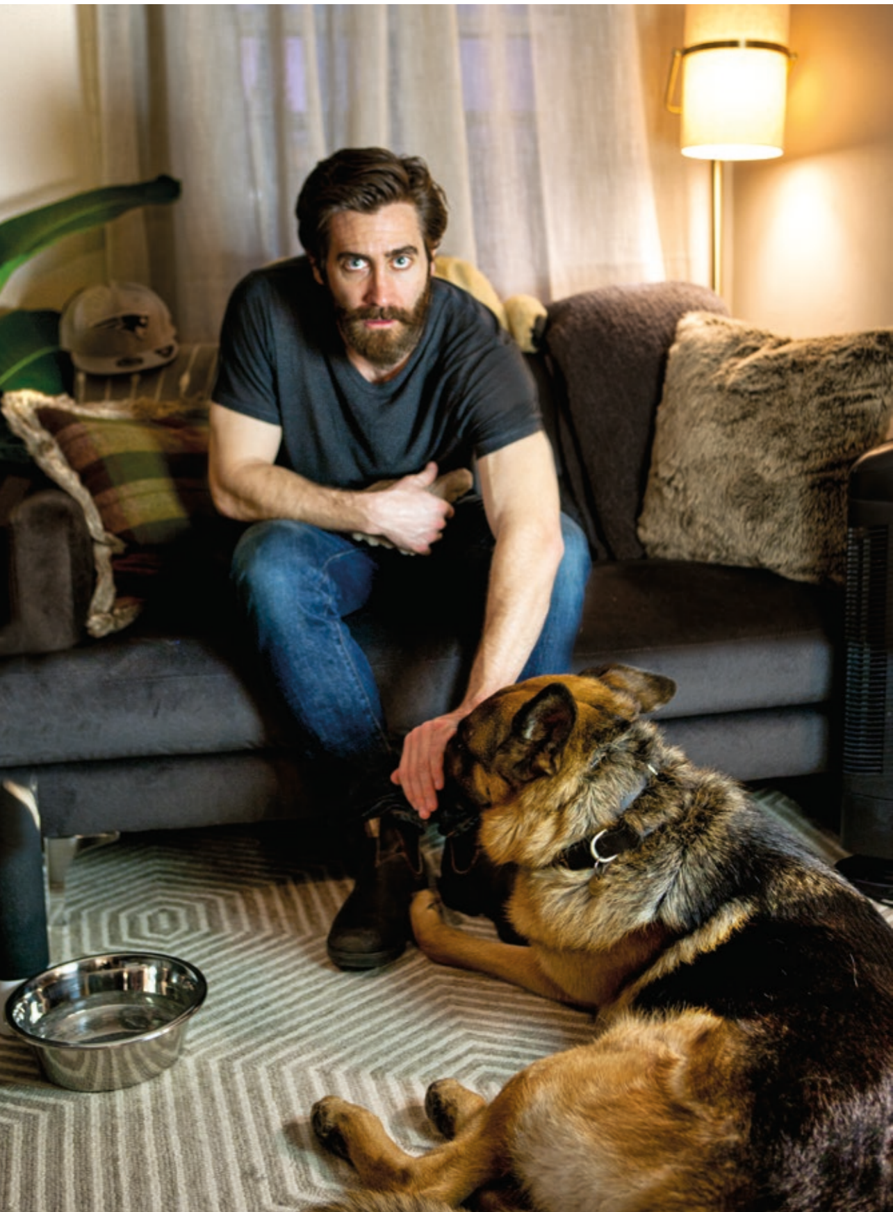
LEFT: JAKE GYLLENHAAL, SUNDAY IN THE PARK WITH GEORGE , NEW YORK CITY CENTER, 2017 A true gentleman, and his dog seemed to mirror his personality perfectly.