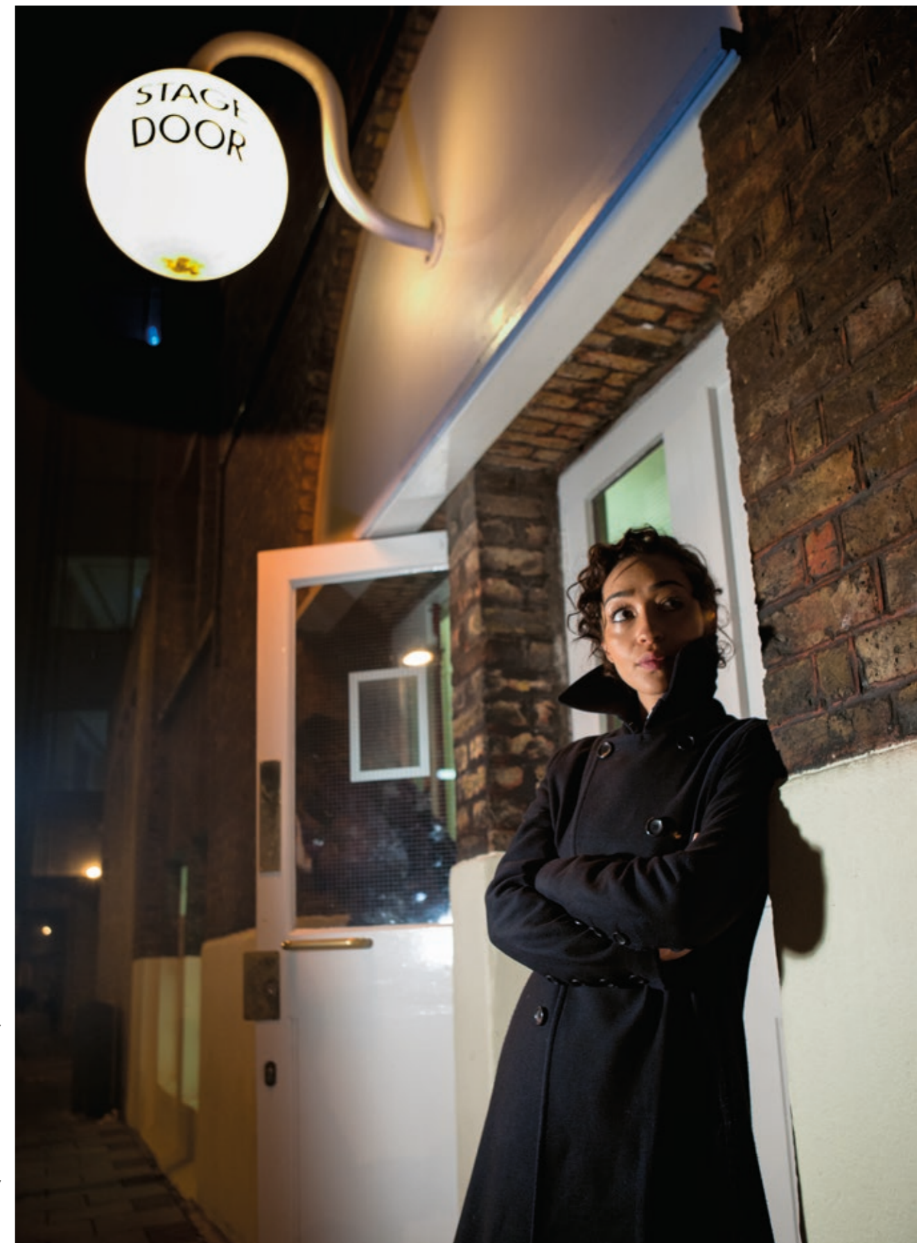
RIGHT: RUTH NEGGA, PLAYBOY OF THE WESTERN WORLD , OLD VIC THEATRE, 2011 In the early days of her career. The physical wall marks the boundary line between the world outside and the world of the play inside.