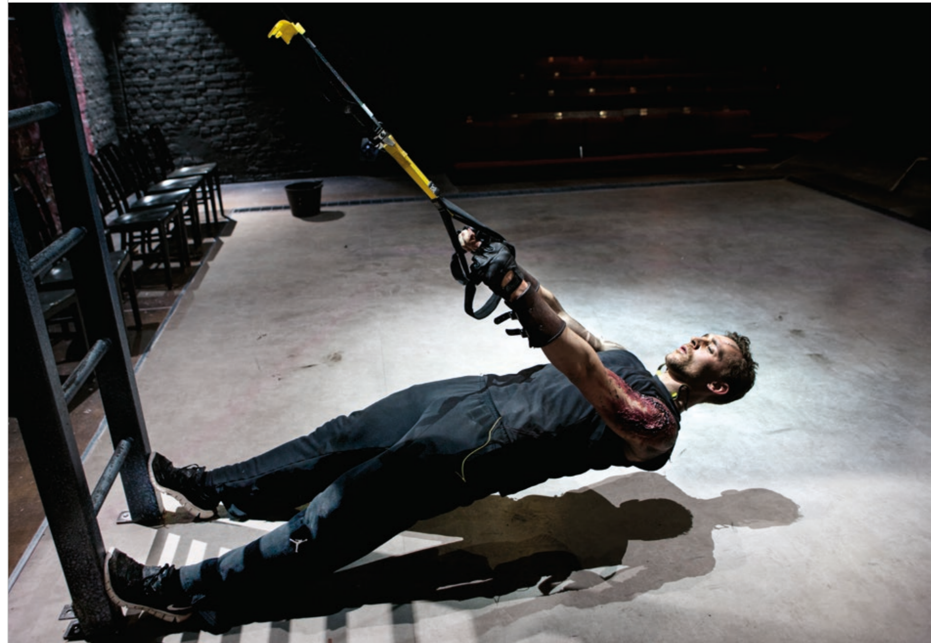
BELOW: TOM HIDDLESTON, CORIOLANUS , DONMAR WAREHOUSE, 2014 Known for The Avengers , The Night Manager and Thor , Tom is preparing for a role full of physical and mental challenges.