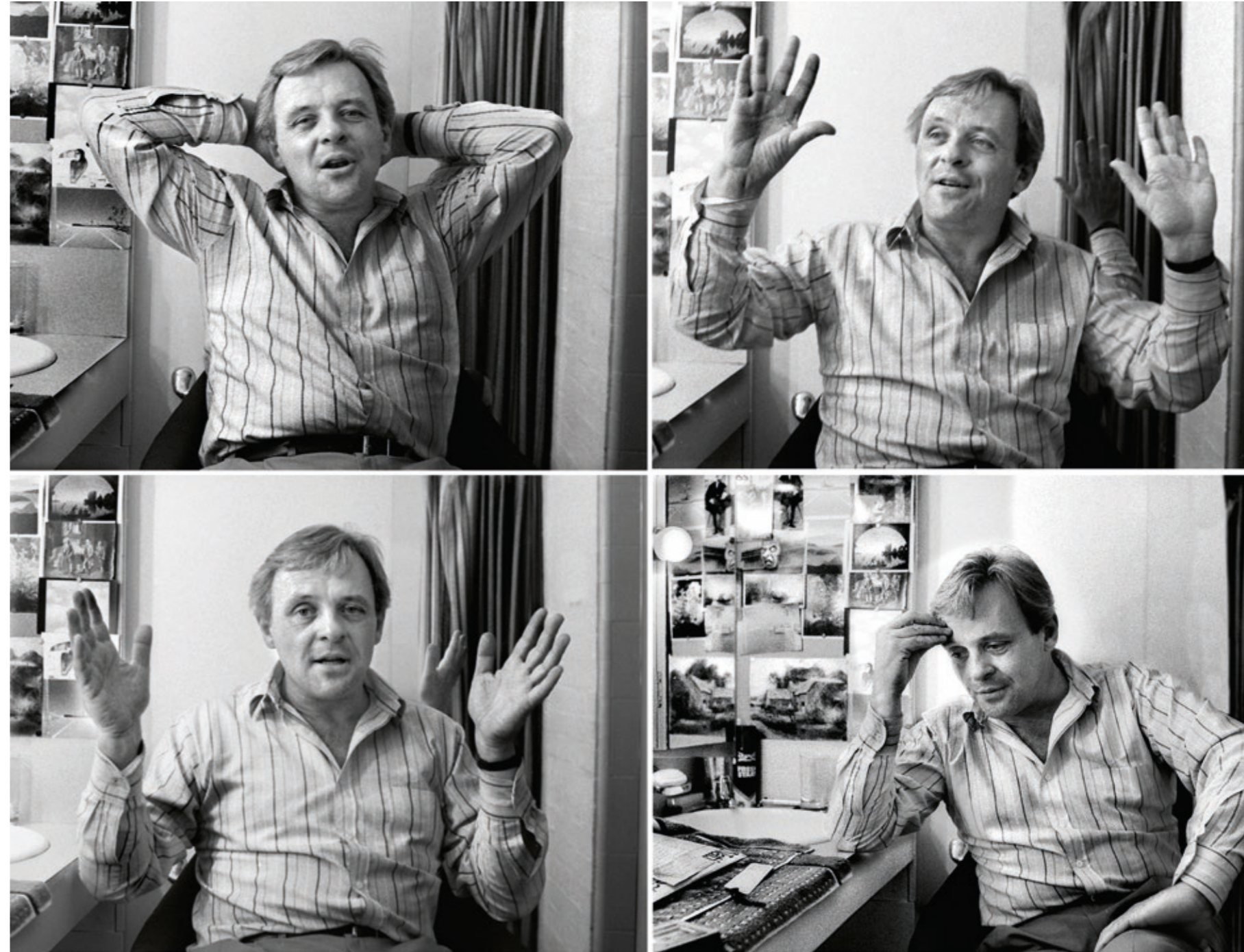
OPPOSITE: Anthony Hopkins, Pravda , National Theatre, 1986. In those days, interviews were part of the session and Tony explained at length why he had returned from America. His portrayal of Lambert LeRoux was the strongest performance of power I ever saw.