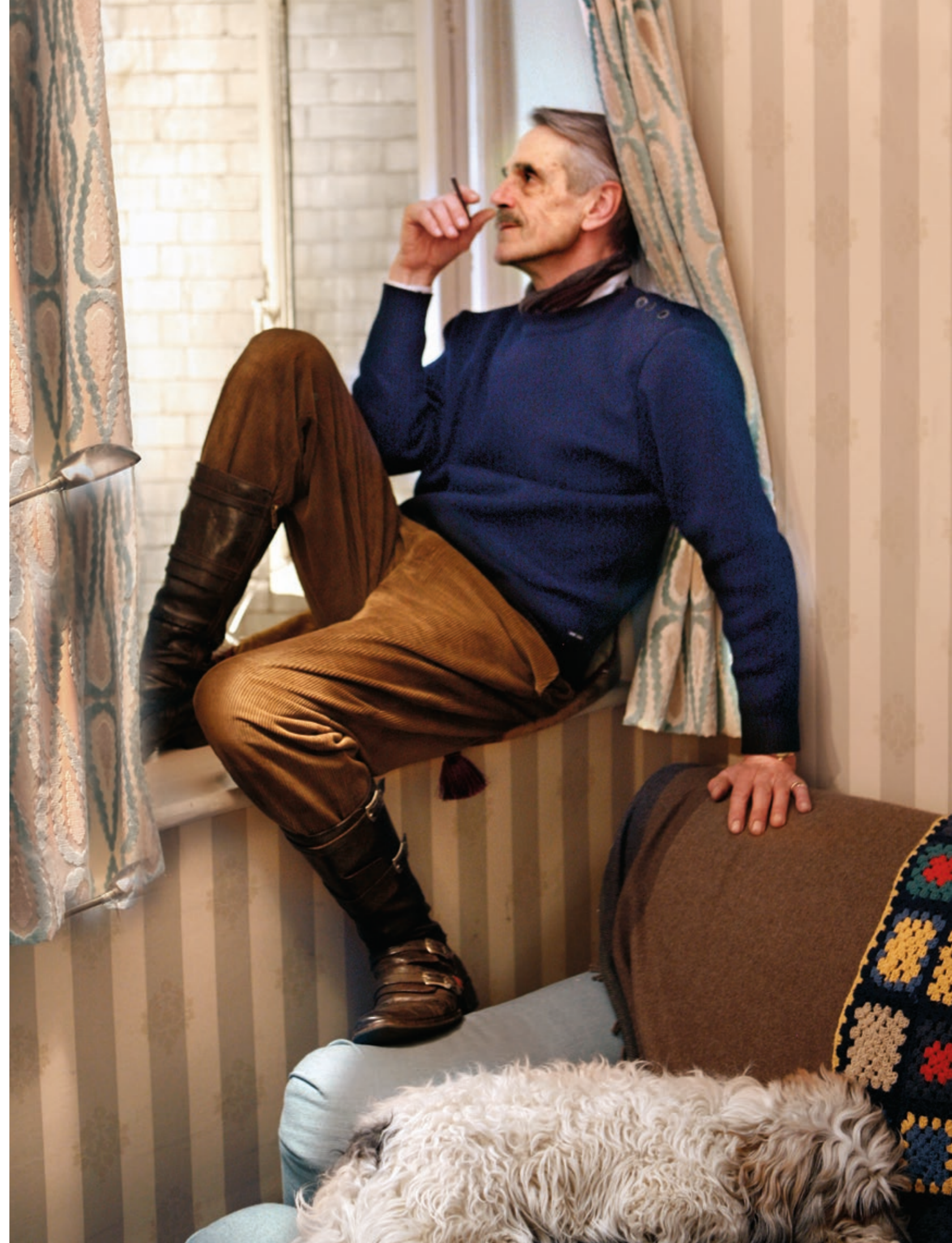
OPPOSITE: JEREMY IRONS, A LONG DAY'S JOURNEY INTO NIGHT , WYNDHAM'S, 2018 One of the few people who makes all heads turn when entering a room. This is the first image of our session. Jeremy is still reminiscing about his day, before preparing for the lengthy role of James Tyrone in Eugene O'Neill's classic.