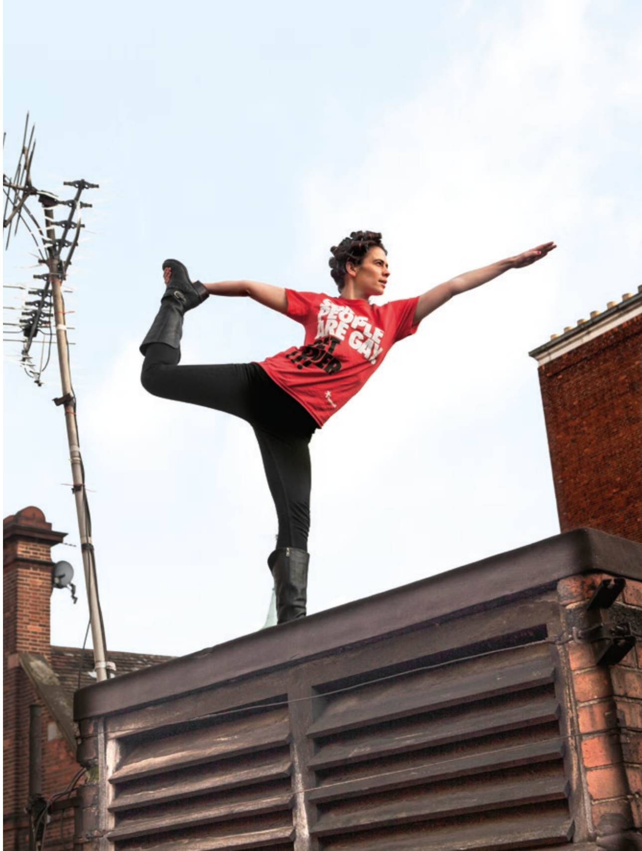
LEFT: HAYLEY ATWELL, THE PRIDE , TRAFALGAR STUDIOS, 2013

Hayley likes to have fun. She has lent her immense talent to a variety of projects, including the Captain America films and numerous stage roles. A wonderfully outgoing and inclusive personality, I have never heard a bad word said about her.