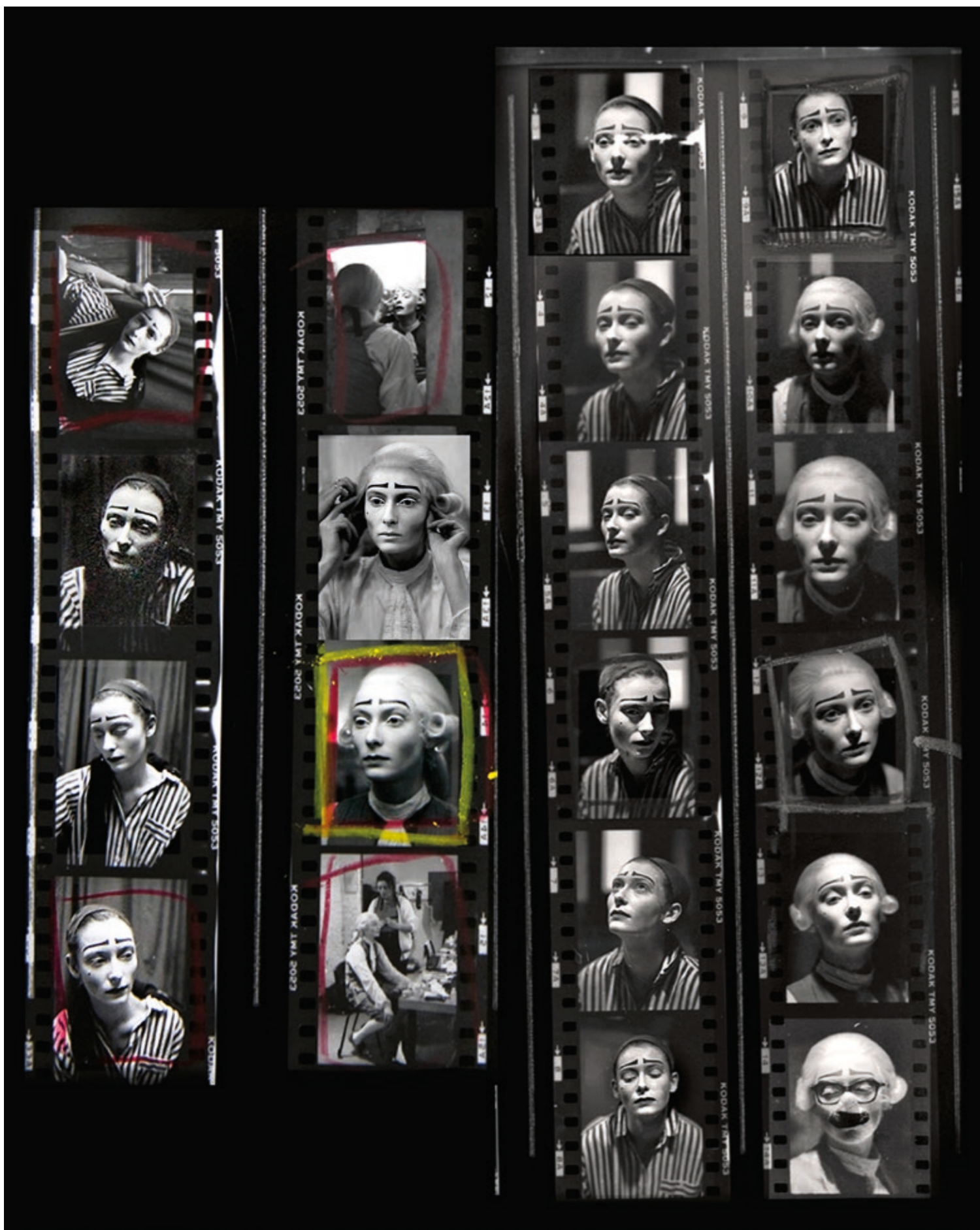
OPPOSITE: Tilda Swinton, Mozart and Salieri , Almeida, 1989. Tilda is photogenic doing just about anything.